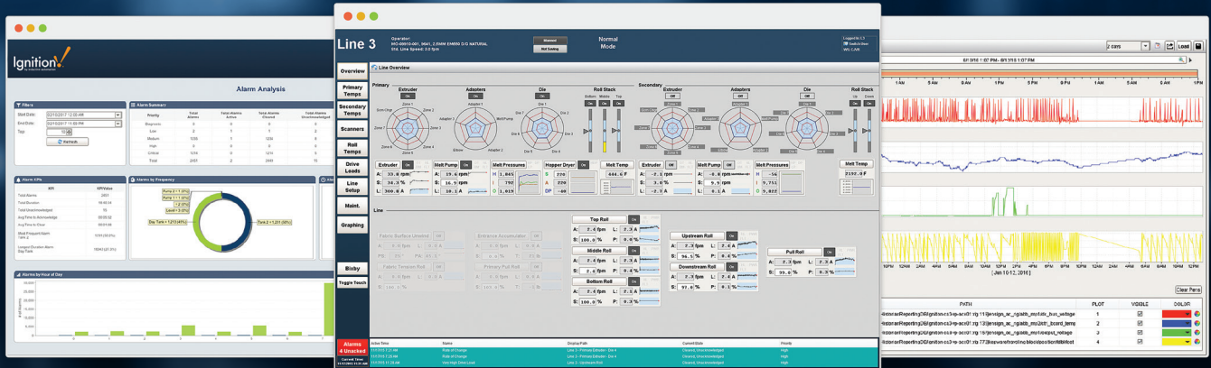
Screens courtesy of Bixby International (middle) and Kymera Systems (right) showing Ignition's extensive visualization capabilities.